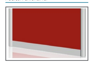
Dove Nearest Pantone: 417